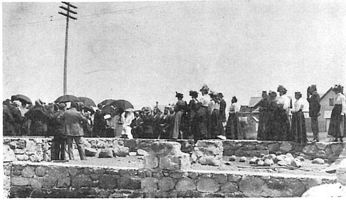
The laying of the first Cornerstone June 3, 1900