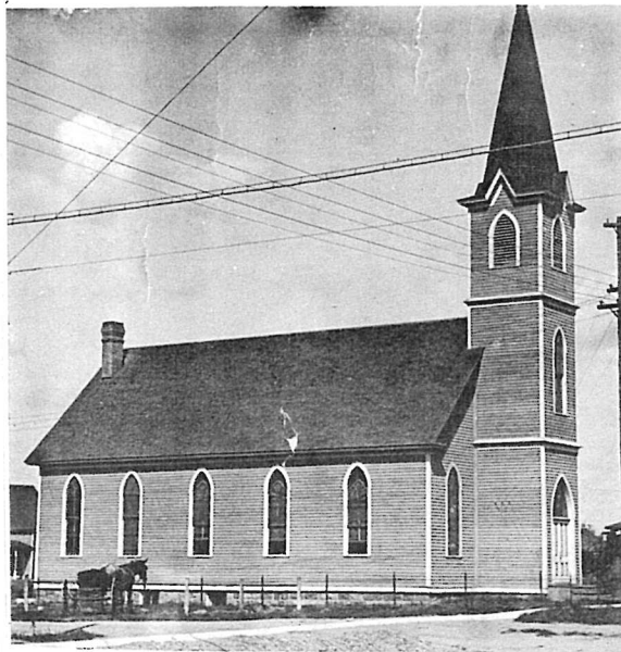
OLD CHURCH 1900-1930