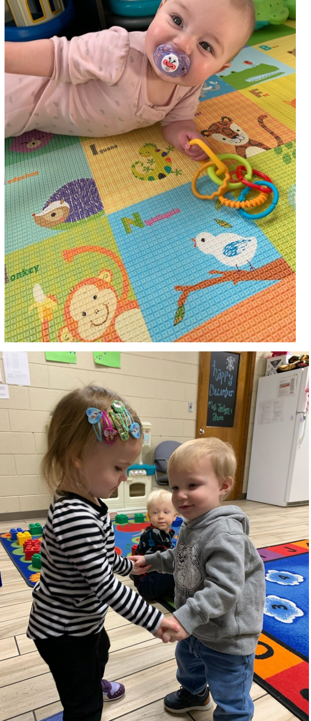
Child in Our Hands Fun activities