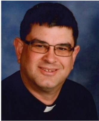
Photo Directory- It has been five years since the last St. John's photo directory was produced. Plans are underway to start production of a new directory that should be available before Christmas. The key to any good directory is wide participation. Dutton's Valley Gallery from Valley City will be working with us on this project. They will be offering several days of photography at St. John's in August

and again in October. There will be no cost to individuals and families to have their picture taken and included in the directory. Portraits may be purchased at a reasonable cost. Congregational activities will be photographed as part of the October dates. This directory is for all members and friends who participate in the life of the congregation. Invitations will be extended to active and inactive members of St. John's who live in the area. You can help this directory by signing up early for a photo appointment, calling and inviting you family members to let them know about this opportunity, and reaching out to former members who we haven't seen for a while.