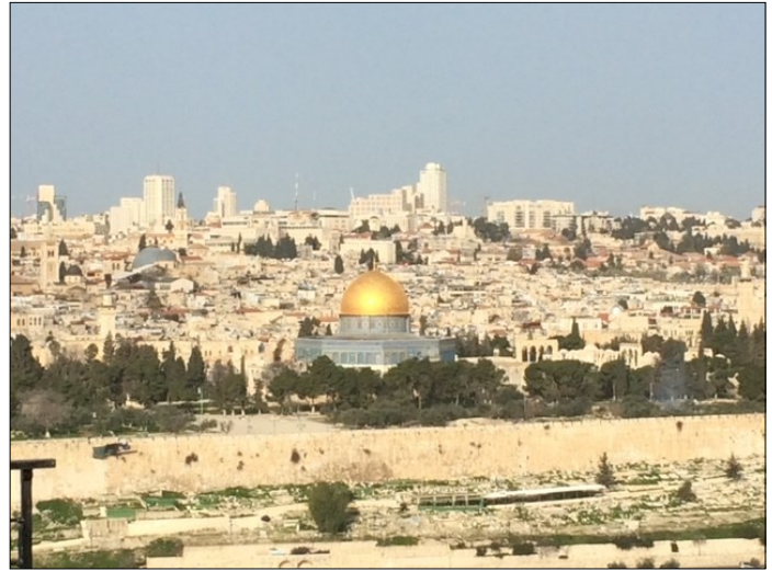
Jerusalem from the Mount of Olives

August 4-16 thirteen people from eight different congregations will be exploring the Biblical theme of Jubilee at Holden Village in the Cascade Mountains of Washington. Watch for our story next month.