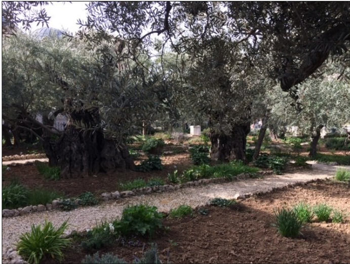
Garden of Gethsemane