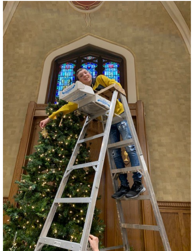
Decorating the Sanctuary for Advent after worship