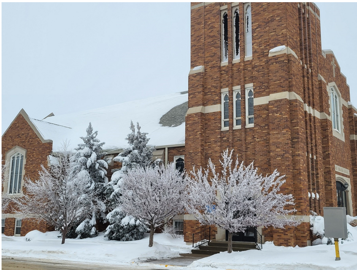
Frosted trees have been pretty this winter