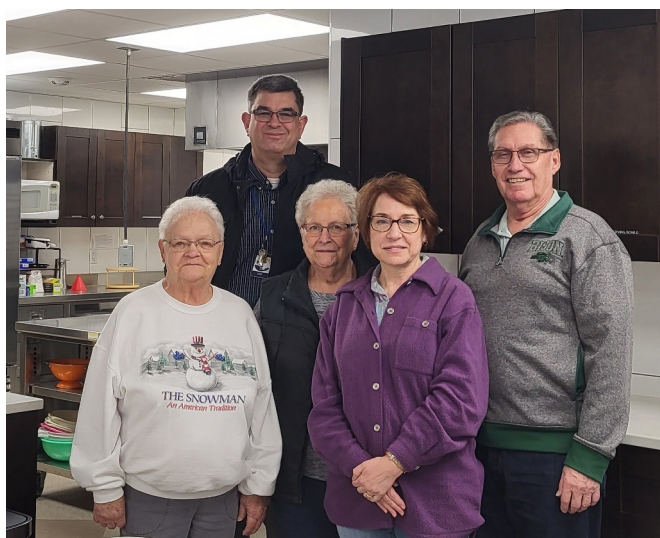
A kitchen field trip to Peace Lutheran in Fargo inspired our team.