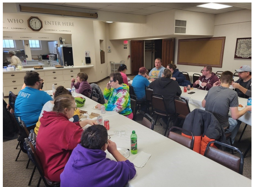
Most Thursdays Triumph clients and DSP's help restock and clean the sanctuary. St. John's threw a pizza party to say thank you.