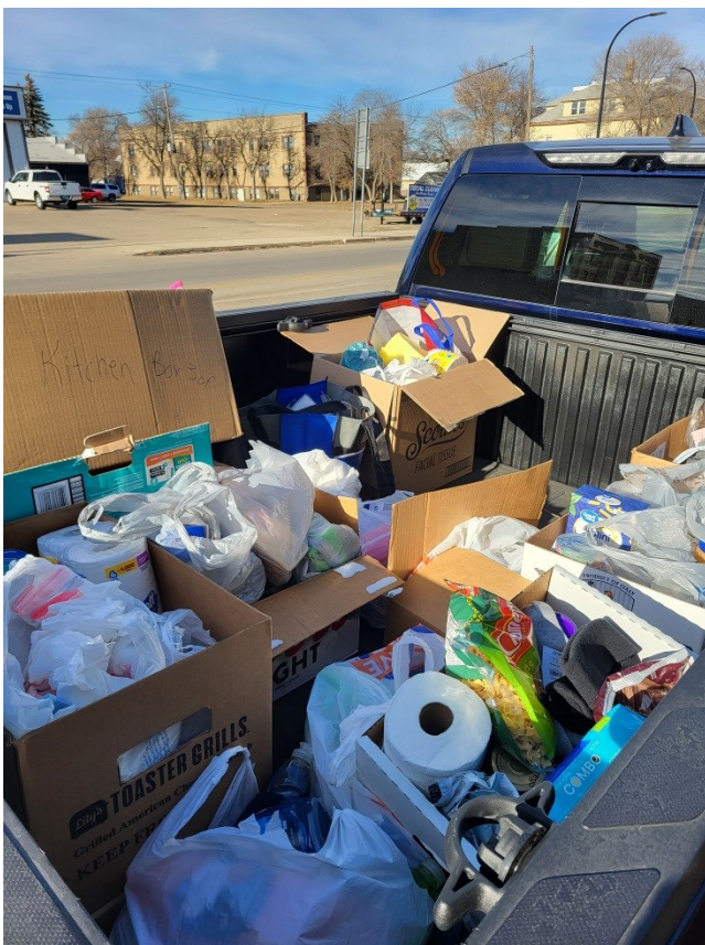
A full load of goods was delivered to the Salvation Army on Dec. 7th. Thank you to everyone who contributed and participated in the Reverse Advent Calendar. State Hospital items were also delivered.