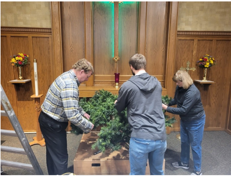
Thank you to everyone who helped decorate the sanctuary for Advent and Christmas. The tree looks beautiful. Well done.