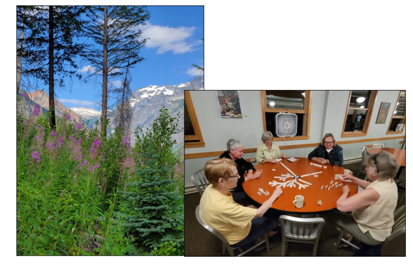
Cascade Mountains above Holden Village